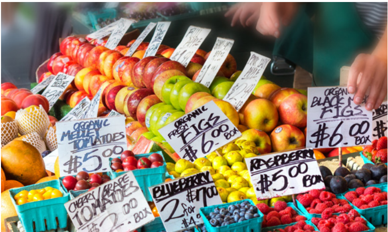
Bloor West Village