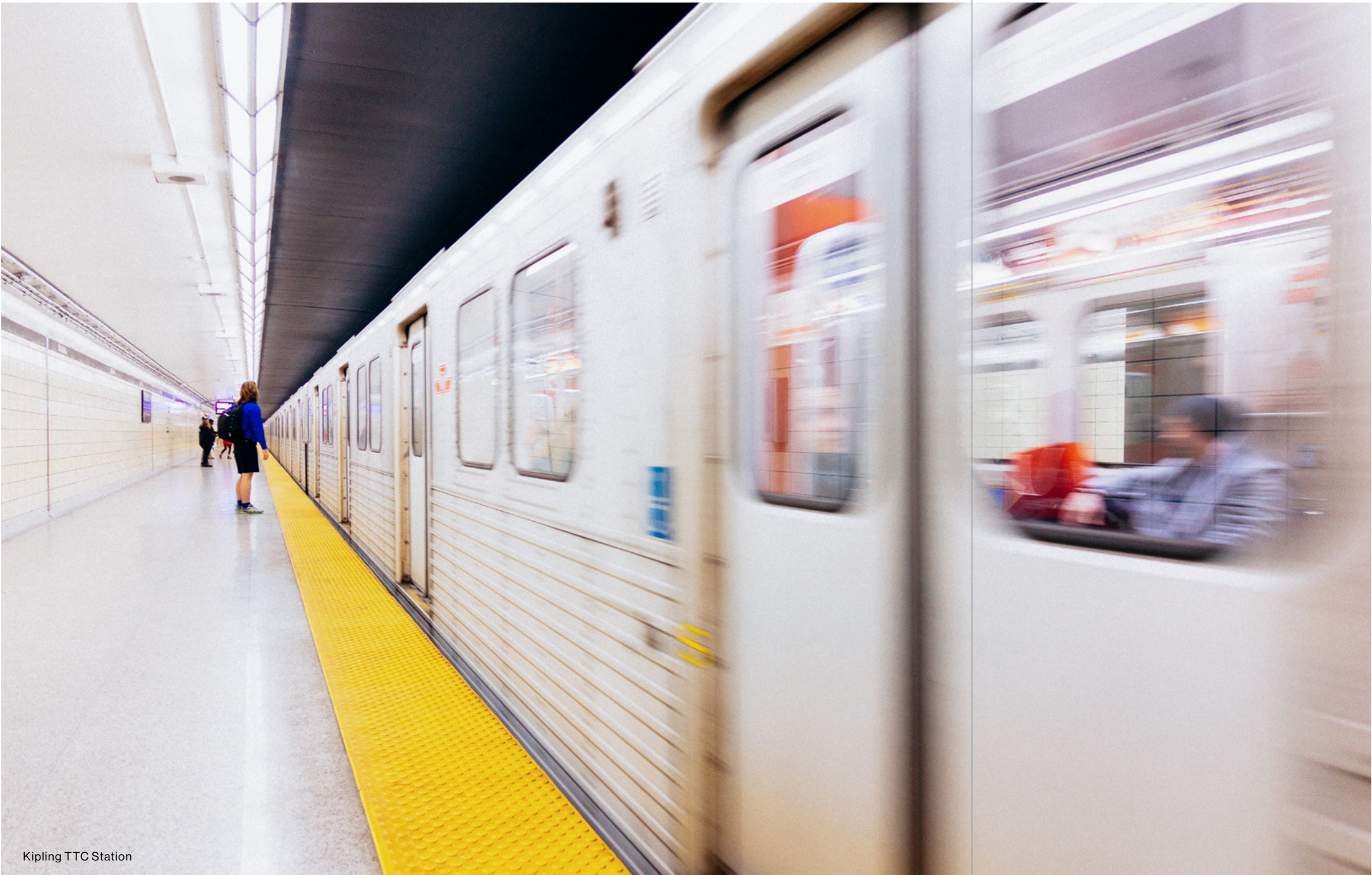
Kipling TTC Station