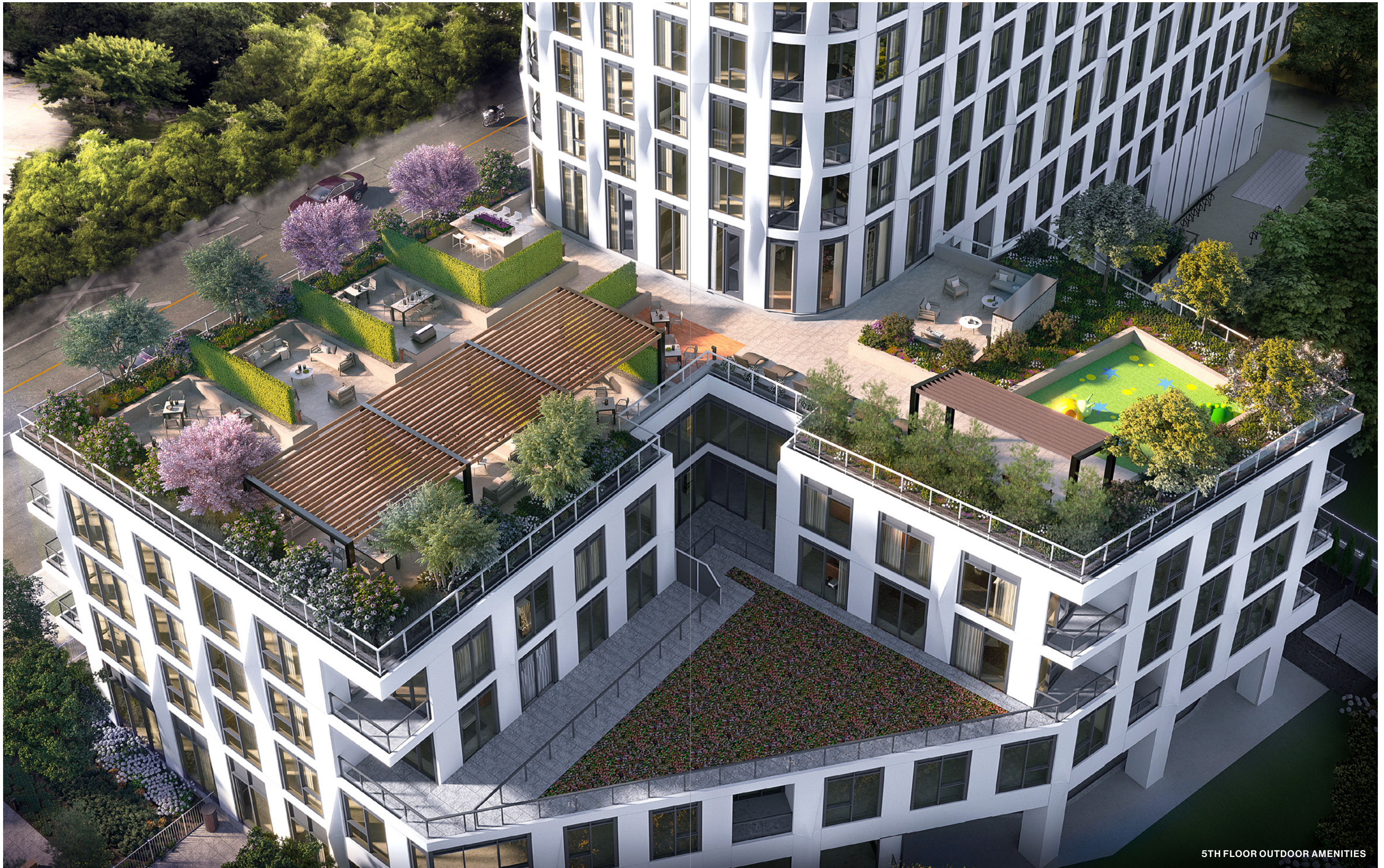
5TH FLOOR OUTDOOR AMENITIES