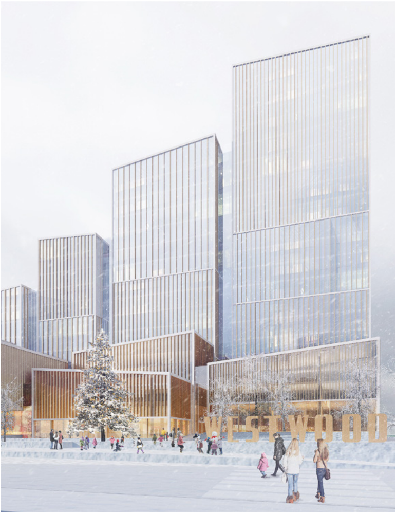
Future Etobicoke Civic Centre

At Kipling and Dundas, a brand new Etobicoke Civic Centre is set to rise on the lands of the old Westwood Theatre. Encompassing 360,000 sq.ft., it will house city staff offices and council chambers, a library, art gallery, rec centre, and child care facilities – and be a showcase of sustainability.