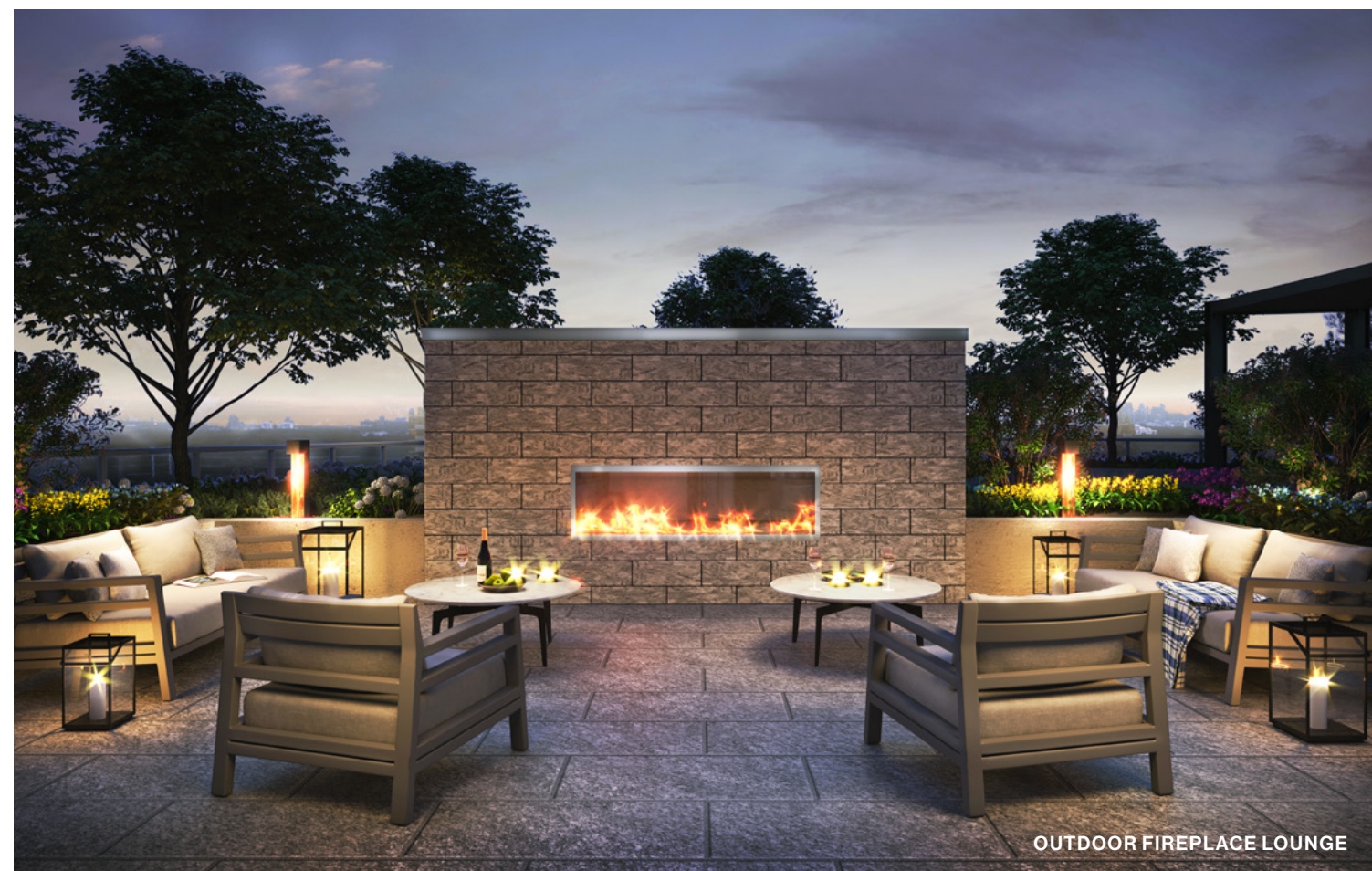
OUTDOOR FIREPLACE LOUNGE