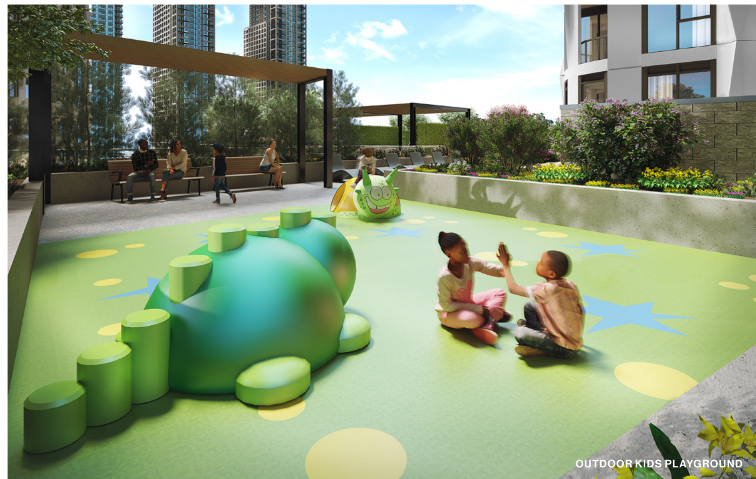
OUTDOOR KIDS PLAYGROUND