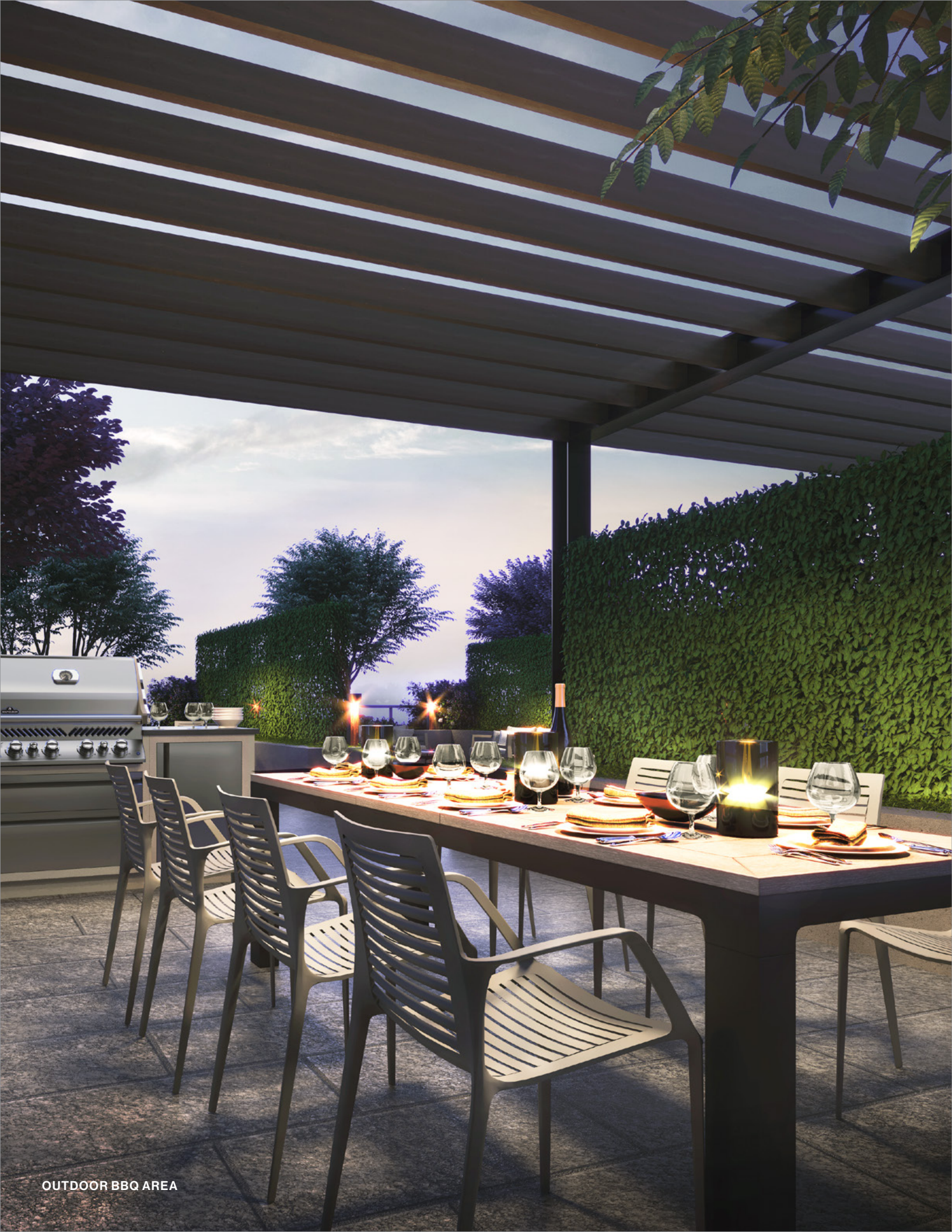
OUTDOOR BBQ AREA