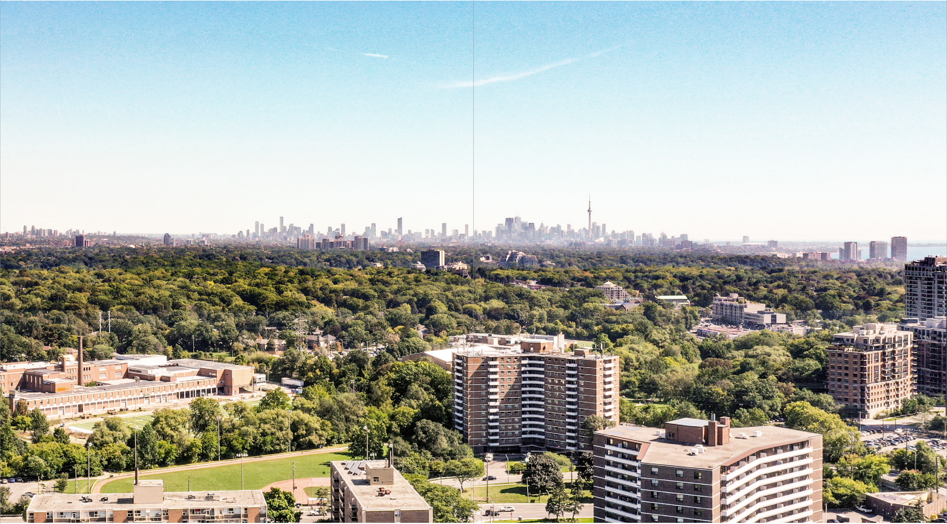
SOUTH EAST VIEW